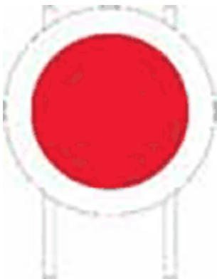
Figure 37a. Directional sign, lower

Directional signs may be used to specify the crossing point of a cable or pipeline and the channel if this cannot be indicated clearly enough with the cable panels. The vertical line through the lower (Figure 37a) and the upper (Figure 37b) directional signs indicates the location of the cable or pipeline in the channel. The lower directional sign is a circular red sign with a white border. The width of the white border is \frac{1}{8} of the diameter of the sign. The upper directional sign consists of two signs one on top of the other and the one above is the same as the lower directional sign. Immediately below it is a square-shaped white sign with a red border, the width of which is \frac{1}{8} of the diagonal of the sign. The heights of the directional signs are designed to be easily perceptible from the channel crossing the cable.