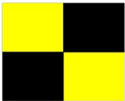
Figure 2. L signal flag