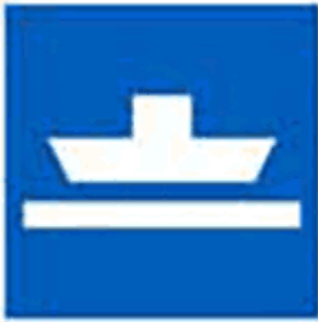
Figure 29. Ferry-boat crossing (not moving independently)