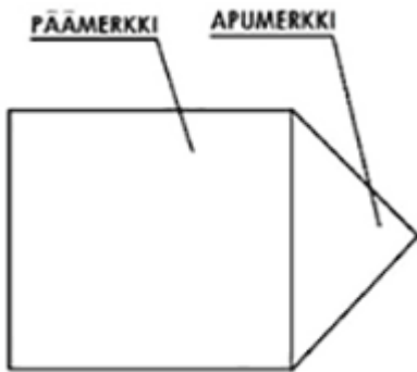
Figure 34a. Auxiliary sign showing the direction where the main sign applies

The auxiliary sign shows the direction where the main sign applies. The sign is a right-angle triangle and its right angle indicates the direction where the main sign applies (Figure 34a). The hypotenuse of the triangle is of the height of the main sign and it is placed immediately next to the main sign.