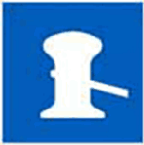
Figure 26. Making fast to the bank permitted

The making fast to the bank sign indicates that a watercraft or a timber float may be made fast to the bank or dock at the position of the sign and 50 metres on both sides of it unless the application zone has been otherwise indicated by an auxiliary sign. The sign displays a symbol representing a bollard and a rope (Figure 26).