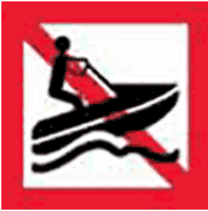
Figure 12. Water bikes prohibited