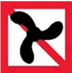
Figure 11. Motorised craft prohibited

The motorised craft prohibited sign prohibits the use of motor-driven watercraft. Restrictions relating to navigation and the application zone of the sign are specified by an auxiliary sign, where necessary. The sign displays a symbol representing a propeller.