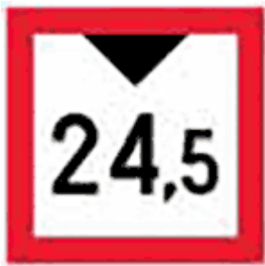
Figure 18. Headroom limited

fitted on a bridge truss. With regard to overhead cable crossings, the sign may be attached directly to the cable. If the sign is equipped with an auxiliary sign showing the effective direction (Figure 34), it indicates the maximum overhead clearance in the direction indicated by the auxiliary sign.