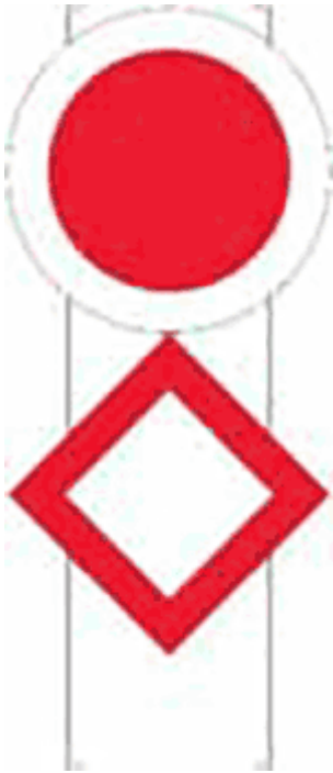
Figure 37b. Directional sign, upper