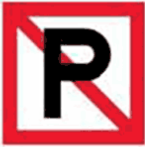
Figure 4. No berthing