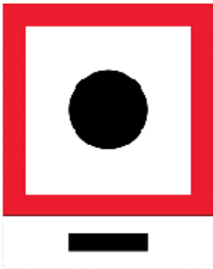
Figure 15. Give a sound signal

The sound signal sign indicates the position where a watercraft shall give a sound signal, the type of which is indicated by an auxiliary sign. There is a circle at the centre of the sign. The sign is positioned on the right-hand side of the channel in the direction of traffic (Figure 15).