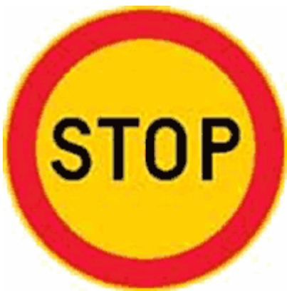
Figure 1. An example of a stop-signal signboard

The Finnish Transport and Communications Agency may issue more detailed regulations on the positioning, colours, structure and dimensioning of other than the international stop signals.