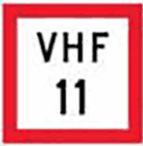
Figure 16. Obligation to enter into a radiotelephone link