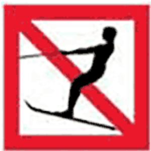
Figure 9. Water skiing prohibited

The water skiing prohibited sign prohibits water skiing. The application zone of the sign is specified by an auxiliary sign, where necessary. The sign displays a symbol representing a water skier (Figure 9).