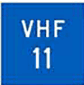
Figure 31. Possibility of a radiotelephone link

The radiotelephone sign indicates that there is a possibility for a radiotelephone link from the channel using the calling channel indicated on the sign. The sign displays the abbreviation of the radiotelephone type and the number of the calling channel below it (Figure 31). The sign is positioned in an easily visible place in the direction of traffic.