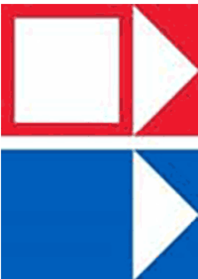
Figure 34b. Rectangular base of an auxiliary sign

In order to increase perceptibility, the auxiliary sign indicating the direction where the main sign applies may have a rectangular base the colour of which is determined on the basis of the colours of the main sign (Figure 34b).