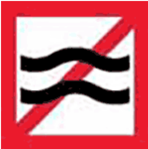
Figure 8. Do not create wash

The application zone of the sign is specified by an auxiliary sign, where necessary. The sign displays a symbol representing waves (Figure 8).