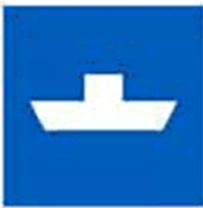
Figure 30. Ferry-boat crossing (moving independently)