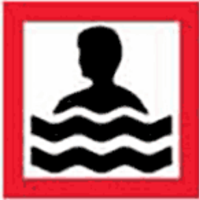
Figure 24. Warning of beach area

The beach area sign gives a warning about a swimming place. The sign displays a symbol representing the head of a swimmer and waves (Figure 24).