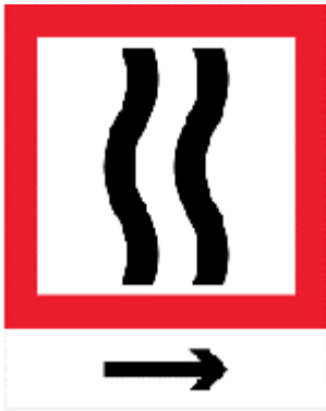
Figure 22. Strong current and direction

The strong current sign gives a warning that, after the sign, the current in the channel can interfere with the navigation of a watercraft. The direction of current is indicated by an auxiliary sign, where necessary. The symbol at the centre of the sign represents a current. The sign may be positioned on either the right-hand side or the left-hand side of the channel in the direction of traffic (Figure 22).