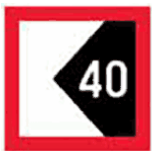
Figure 23. Edge of the channel

The edge of the channel sign gives a warning about the edge of the channel and the sign indicates the distance to the edge of the channel. The broad triangle at the centre of the sign gives the perpendicular direction to the edge of the channel and the numbers inside the triangle indicate the distance of the channel edge in metres from the sign (Figure 23).