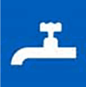
Figure 32. Drinking water supply

The drinking water supply sign indicates access to drinking water. The sign displays a symbol representing a water tap (Figure 32). The sign may also be equipped with an auxiliary sign with information on the location of the drinking water supply.