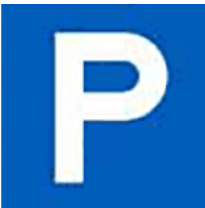
Figure 25. Berthing permitted

The berthing permitted sign indicates the docks reserved and other sites intended for berthing. Making fast of a watercraft or a timber float to the bank is permitted or, if this is not possible, their anchoring is permitted on the side of the channel where the sign is positioned. The sign displays the letter P (Figure 25.) The sign may be equipped with an auxiliary sign in accordance with Figure 34 indicating the effective direction of the main sign.