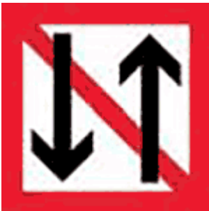
Figure 7. No passing or overtaking

The no passing or overtaking sign prohibits both the passing of an oncoming watercraft and the overtaking of another watercraft in a section of a channel between the sign and a sign positioned for the opposite direction of traffic or to indicate the end of a prohibition unless the application zone of the prohibition has been indicated otherwise. The prohibition need not be complied with when passing a timber float or a watercraft of under 20 metres in length if there are no impediments to free passage. The sign is positioned on the right-hand side of the channel in the direction of traffic. The sign has two arrows pointing in opposite directions (Figure 7).