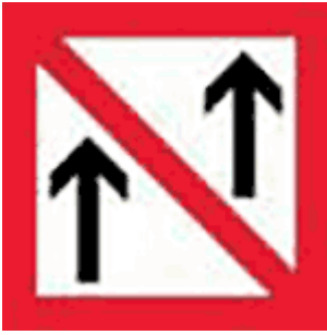
Figure 6. No overtaking