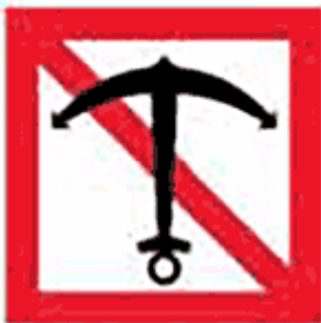
Figure 3. No anchoring

The no anchoring sign prohibits anchoring and trailing of anchors, their cables and chains in an area starting 100 metres before the sign and ending 100 metres after the sign. The sign is positioned on each side of the channel at the position where anchor use is prohibited due to an underwater cable or structure so that the sign is visible when proceeding in either direction. The sign displays a symbol representing an anchor (Figure 3).