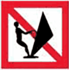
Figure 10. Use of sailboards prohibited