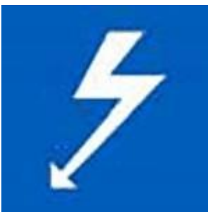
Figure 27. Overhead cable crossing

The overhead cable crossing sign indicates an overhead cable crossing a water area. The sign may be positioned either on the right-hand shore in the direction of traffic or on both shores of the water area at the point where the wire alignment crosses the channel. The sign displays a symbol representing a bolt of lightning (Figure 27). The sign is used together with the headroom limited sign placed on top. If there are several overhead cables in close proximity, the outermost cables are marked with a combination of the headroom limited and overhead cable crossing signs and with a possible auxiliary panel. In that case, the headroom limited sign indicates the safe height for passing under the lowest overhead cable. No overhead cable sign is used in connection with a headroom limited sign attached to the overhead cable.