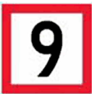
Figure 17. Speed limit

The speed limit sign indicates the maximum speed allowed in kilometres per hour (km/h). Any specifications of the application zone of the speed limit or the speed limit in knots are given by an auxiliary sign. Where possible, the speed limit sign concerning a channel is positioned on the right-hand side of the channel in the direction of traffic (Figure 17).