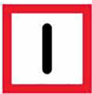
Figure 21. Warning sign

The warning sign indicates that special caution needs to be observed by water traffic in its vicinity. The cause for the warning and the specifications regarding the application zone of the sign are given by an auxiliary sign, where necessary. A vertical line runs at the centre of the sign (Figure 21).