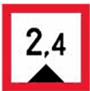
Figure 19. Depth of water limited

The depth of water limited sign indicates that the depth of water is limited in a channel at the position of the sign or in a section equipped with said signs. The numbers at the centre of the sign indicate the maximum depth of water in metres. The bottom of the sign displays a triangle pointing upwards (Figure 19).