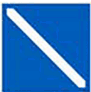
Figure 33. End of a prohibition, an obligation or a restriction

The end sign indicates the end of a prohibition, an obligation or a restriction. The sign displays a diagonal line (Figure 33). The sign is positioned on the right-hand side in the direction of traffic or on the reverse side of a prohibitory, mandatory or restrictive sign meant for the opposite direction of traffic.