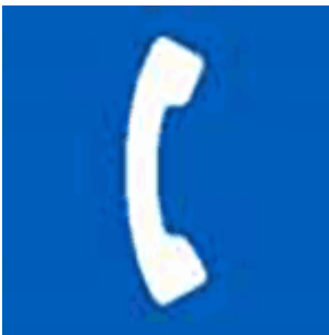
Figure 28. Telephone

The telephone sign indicates access to a public telephone. The sign displays a symbol representing a telephone (Figure 28). The sign may be equipped with an auxiliary panel in accordance with Figure 35 stating the location of or distance to the phone.