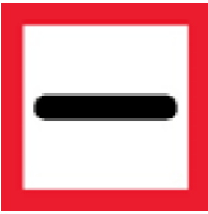
Figure 14. Stop sign