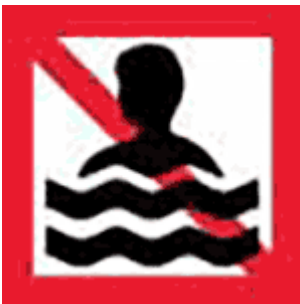
Figure 13. Swimming prohibited

The swimming prohibited sign prohibits swimming in a water area. The application zone of the sign is specified by an auxiliary sign, where necessary. The sign displays a symbol representing a swimmer and waves (Figure 13).