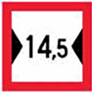
Figure 20. Width of passage or channel limited

have triangles and the numbers between the apexes of the triangles indicate the width. The sign may be positioned on either the right-hand side or the left-hand side of the channel in the direction of traffic (Figure 20).