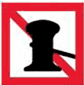
Figure 5. No making fast to bank

The no making fast to bank sign prohibits the making fast to the shore or dock of a watercraft and a timber float for 50 metres on each side of the sign unless the application zone has been otherwise indicated by an auxiliary sign. The sign displays a symbol representing a bollard and a rope (Figure 5).